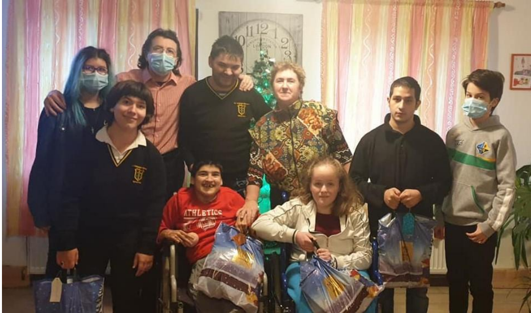
Pictured: The young adults from Casa St Patrick- New Year Party and Gifts paid for by School Aid Romania. Below: Casa St Maria children receive presents from Eileen Moreland Foundation.

Special thanks to the continued financial support from The Eileen Moreland Foundation and School Aid Romania including St Patrick's College, Maghera; Methodist College, Belfast; Cookstown High School and St Patrick's College, Armagh; St Patrick's High School, Keady.