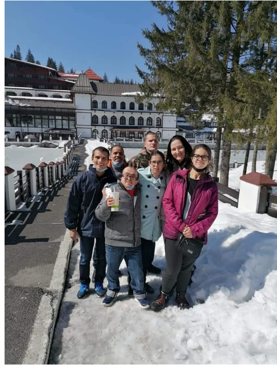
Pictured: Casa Irlanda on holidays and on a day trip to Poiana enjoying the snow. Casa St Patrick, pictured below, enjoying a day out at the zoo